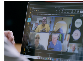
Blind veterans attend a virtual hobby group

There's nothing quite like old comrades coming together to share tips, banter and support. That's why peer-to-peer support is such a key part of our rehabilitation offer. Not only do our veterans help one another through the practical challenges of sight loss, but they also provide mutual acceptance, understanding and a sense of belonging.