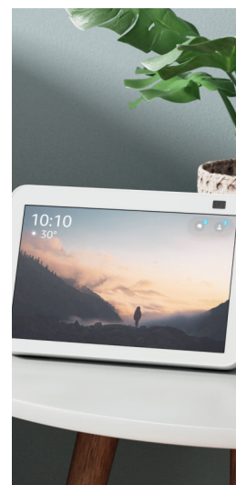
An Alexa screen device

The paramedics told her that had she been trapped there overnight she would have sustained much greater damage to her arm, including the possibility of toxicity in her blood or even losing the arm altogether.