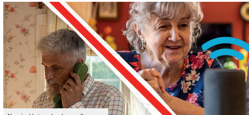
Alexa is able to make phone calls

Thankfully, she remembered her Alexa session and was able to call out to her device and make a phone call for help. She phoned her doctor through the device who then called the emergency services. Help arrived within the hour.