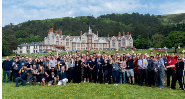
The full team at Llandudno for the Sopra Steria UK event

These companies can offer a wealth of support, from funding to volunteering and even help with research, while in turn we can help them deliver their corporate social responsibility goals.