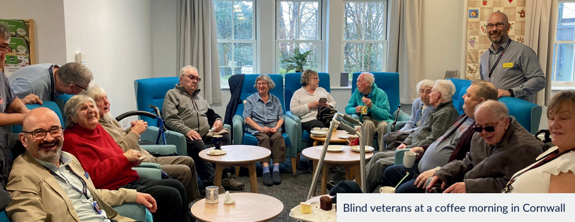
Blind veterans at a coffee morning in Cornwall