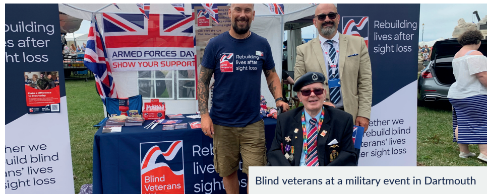
Blind veterans at a military event in Dartmouth