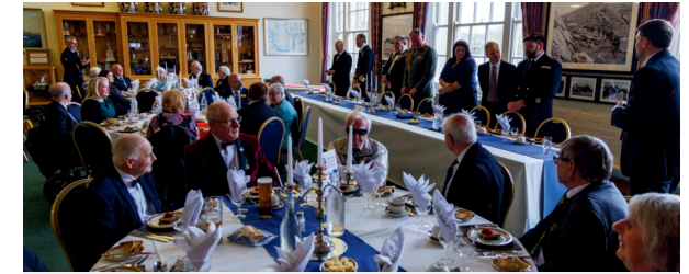
Blind veterans attending a formal military dinner

As well as delivering a full programme of activity breaks at our national Centres of Wellbeing in Llandudno and Rustington, our veterans can also enjoy local outings organised by their community team. In addition to this, our virtual hobby groups give them the chance to mix with their peers from the comfort of their home, learning from one another about hobbies like gardening, woodwork and painting.