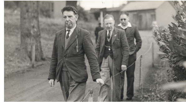
Guide wires used in Church Stretton

At Church Stretton, the charity was loaned several properties in the town and its headquarters was at the Longmynd Hotel. Huts were put up in the grounds of the hotel, on the lawn and the tennis courts, and the garages were converted into workshops.