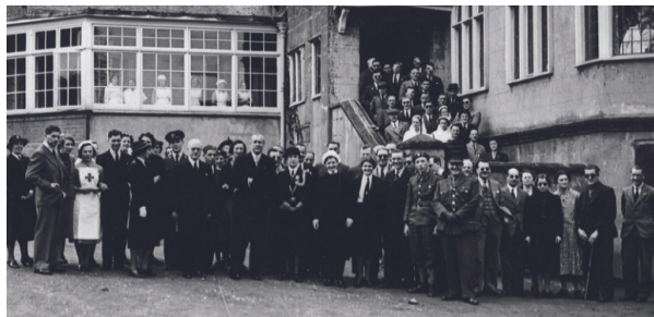
Church Stretton during the war years