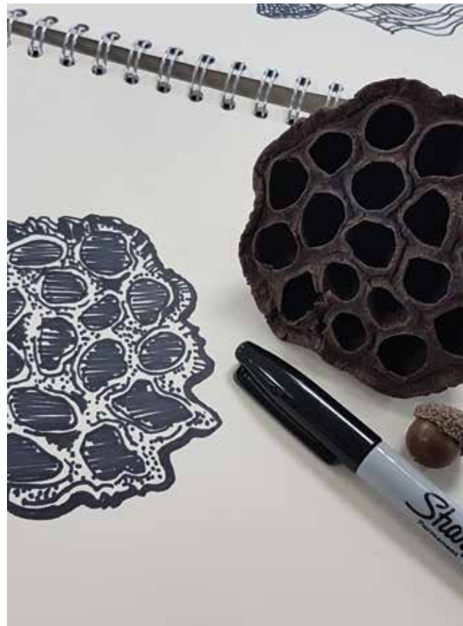
Caption: Sketchbook fun

Celebrate the coronation of King Charles III with our Coronation Crown project, designed especially for Blind Veterans UK. We'll send you everything you need to make a tactile and eye catching souvenir of this historic event. This is a flat mosaic on a wooden base measuring roughly 7 inches x 8 inches (or 18cm x 20cm)