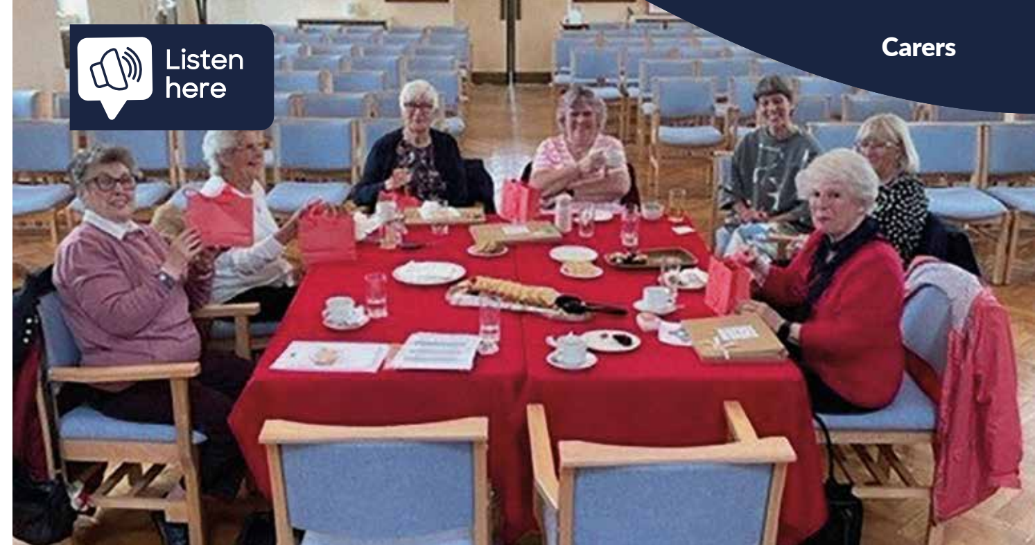
Caption: Carers and staff enjoy a get-together at our Brighton centre