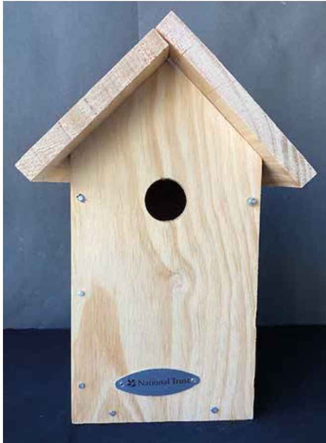
Caption: Build a bird box

Let us know if you would like the opportunity to join our monthly Woodwork Hobby Circle to chat with other Members and receive support with this project.