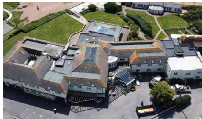
Caption: Our Rustington Centre

We'll provide details about the formal opening ceremony later in the year.