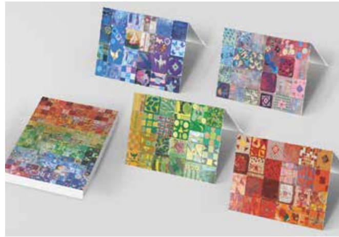
Caption: Our new greeting cards

Introducing the latest addition to our online shop... Collaboration in Colour greeting cards.