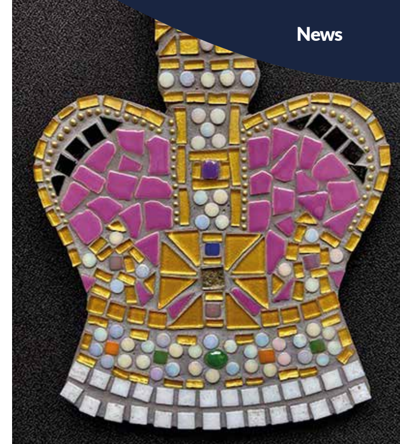
Caption: Coronation crown mosaic

Coronations' week at our Llandudno and Brighton Centres will undoubtedly see the fruits of their labour. With garden parties, picnics and tea dances galore, we have a whole host of right royal activities on offer.