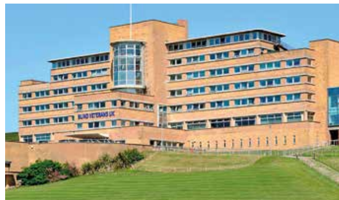
Caption: Brighton Centre will close

Unfortunately, due to capacity, we are unable to provide accommodation at the Centre for this event, but you can apply for a grant to help fund your travel and accommodation costs if need be. Please get in touch with your community team to find out more.