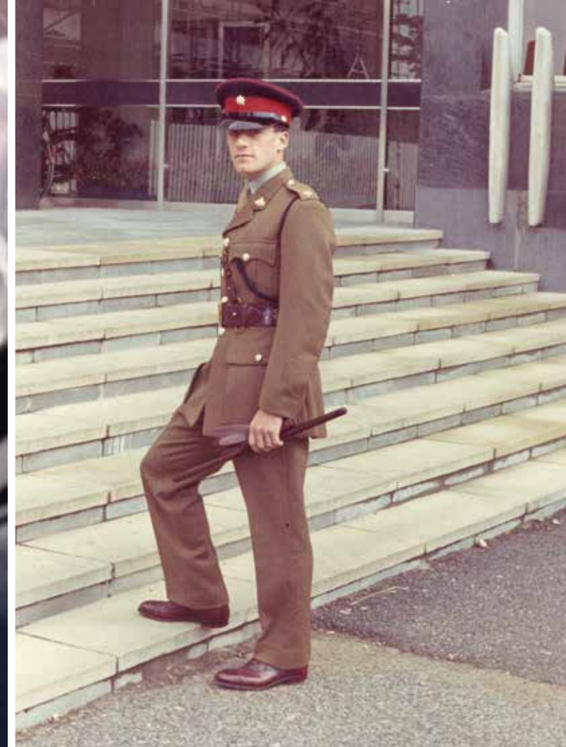
Caption: In his uniform in 1965