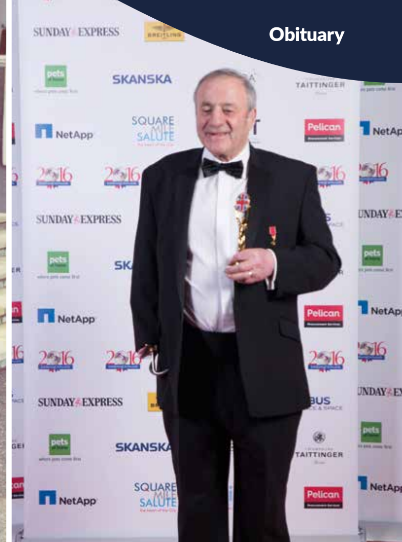
Caption: The Soldiering On Awards